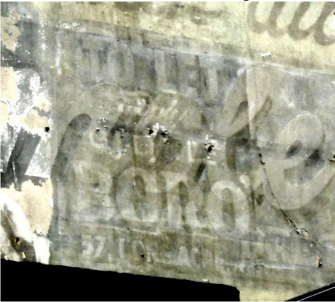
Detail of ghost sign for Germolene at Newington Green, London, N16, with reference to C. J. Lytle at 57 Long Acre. 1928 is the last date that Boro were based at the Long Acre address.