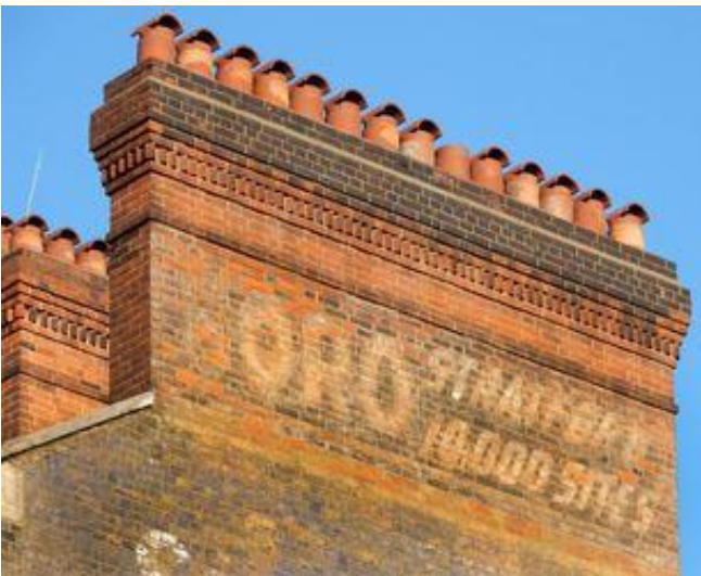
Detail of top of Gillette ghost sign on Grays Inn Road showing Stratford as location, and boasting of 10,000 sites. The business was only based in Stratford for the first 20 years of the 20th Century and there is Boro' advertising from 1919 (Kelly's London Suburbs directory) boasting of the same number of sites, so this is likely contemporary to that, and just pre-dating the sale to Odhams with associated more to Long Acre.