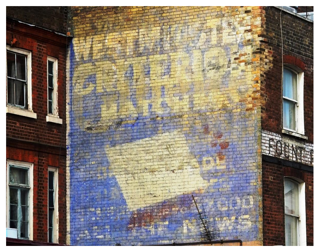
Illustration 1: Gillette/Criterion Matches/Westminster Gazette palimpsest, Stoke Newington Church Street, London

A palimpsest<sup>13</sup> is the appearance of two or more signs in a single location, typically due to a more recent layer of paint gradually fading to reveal earlier painted layers below. An example on one wall in London's Stoke Newington features at least three layers, advertising Gillette, Criterion Matches and the Westminster Gazette respectively. In this instance the immediate question arises as to precisely which sign is being defined as a ghost sign.